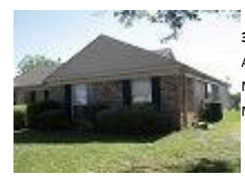
340 Ancestry Annual Consumption Monthly Consumption Monthly Allowance